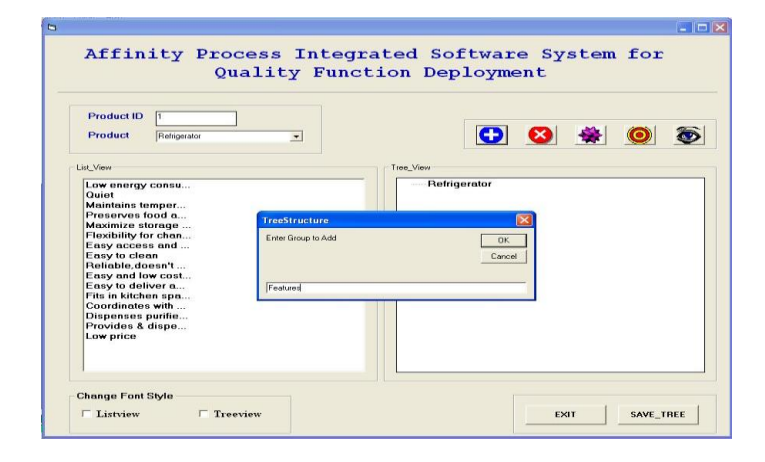
Figure 4: Add Element