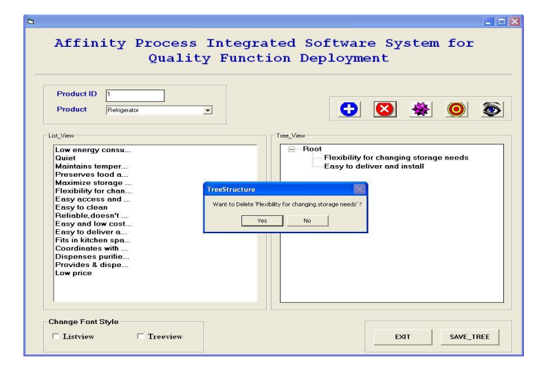
Figure 5: Delete Element CONCLUSIONS

A suitable Affinity Process integrated software system for QFD will not only reduce the unnecessary onus but also assists in producing results in more effective and accurate manner. To this end, this paper presents an Affinity Process integrated software system to cater to the needs of QFD practitioners. In this paper, the development and implementation of the prototype system are discussed in details. The system is developed using Visual Basic 6.0 that integrates an MS-Access database. The use of Visual Basic with MS-Access database is found to be very effective in producing the system under windows environment. Besides the software realization of Affinity Process, the system incorporates certain features like 'Full Screen View', 'Change Font Style' and 'Save Tree', which add new dimension to the tool. The system also facilitates all the needed operations for creating and organizing items like add, rename, move and delete. Further, a set of application programming interface (API) is employed to accommodate larger text items in 'Listview' as no direct function is available. Moreover, in QFD there are situations where at times the Affinity Process cannot be completed in one go and thus it is necessary to resume the previous work rather than starting it all over again. For this, the data can be saved