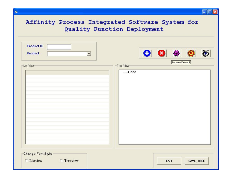
Figure 2: Software Interface

understanding, ease of implementation, ease of testing, ease of modification, and correct translation from the requirements specification (Ahmad & Wei, 2006). VB comes with a rich set of controls that assists in developing interactive user-interface (Li, 2006). VB is a complete form of package for building user interface (Hassan et al., 2006). The software interface is designed and built using VB (Refer Fig. 2). This system has been designed as a framework, which makes it possible to extend it using additional modules. The interface makes use of several controls, which serve different purpose. Besides the basic set of controls, the interface also employs ActiveX controls such as 'Listview' and 'Treeview'.