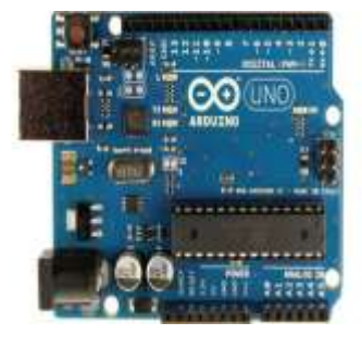
Fig 4.2-Arduino Uno

Basic building block of propose system is arduino. The hardware consists of the following features- the USB plug which is used to upload the program into the board. It can also be used as a source of power supply. The plug supplies a regulated voltage of 5V. In case it is insufficient, an external power supply of 9 to 12V can be given. There are 5 analog pins (A0 to A5). The digital i/o pins are from 2 to 13. The reset button is used to reset the microcontroller in order to run a fresh program. There are 3.3V and 5V power pins to power the Arduino.