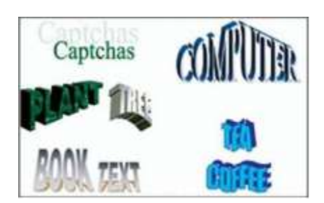
Fig 1: Gimpy CAPTCHA

Baffle text CAPTCHA: It was designed by Henry Baird. It is modified version of Gimpy. In this a random alphabets or characters are picked to form a pronounceable text.