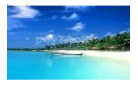
Fig 5: Transparent CAPTCHA

Transparent CAPTCHA: It is a technique in which the text is written in transparent font over an image. It makes difficult for the bots to identify the pixels that represent the exact text and the pixels that the other objects in the image.