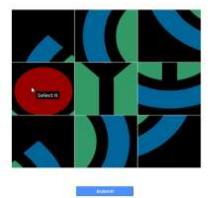
Fig 7: Puzzle based CAPTCHA

Puzzle based CAPTCHA can be classified as picture based puzzle and a mathematical puzzle. In a picture based puzzle, the picture is divided into segments and is shuffled. Each segment will have a segment number followed by the next segment. The user should arrange the puzzle appropriately, so that it could match the original one. Another one is mathematical puzzle which is 100% effective. On the basis of this the registration forms, login can be securely accessed.