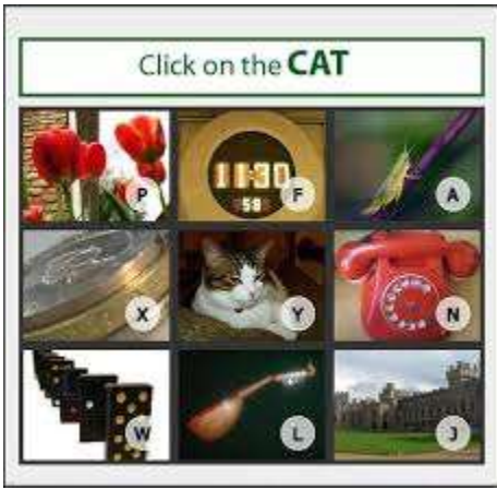
Fig 6: Image based CAPTCHA

Bongo CAPTCHA: In Bongo, visual based pattern identification is provided for the user to solve .It contains right block and left block series. The user should identify how the right and left block series differ from each other.