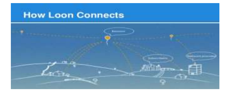
Fig3.1 Transmitting Signals