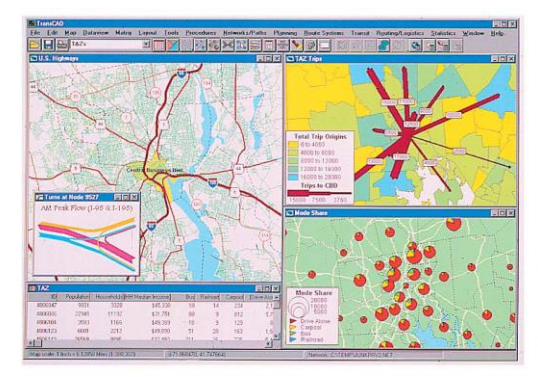
Plate 50 A screen shot from Caliper Corporation's TransCAD package showing the rich functionality of a fully-fledged GIS-T program.

Fig 2: A screen shot from Caliper Corporation's TransCAD package showing the GIS-T program