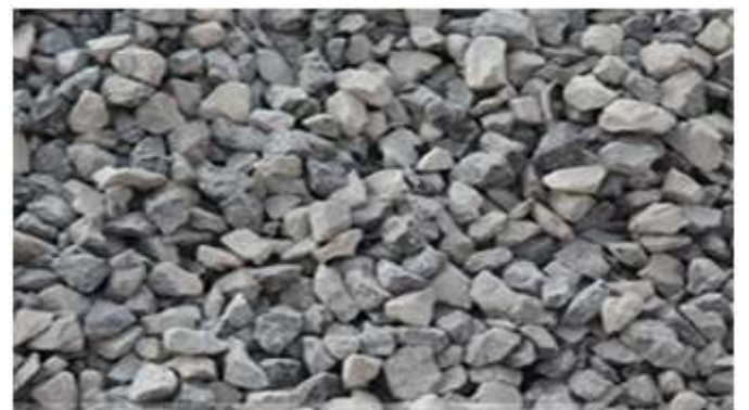
Fig. 1: Artificial Sand 2. LITERATURE REVIEW

2.1. S. A. Daimi "The mixes with the artificial sand with dust as fine aggregate gives consistently higher strength than the mixes with natural sand. The sharp edges of the particles in artificial sand provide better bond with the cement than the rounded part of the natural sand." Published: International Journal of Earth Sciences and Engineering ISSN 0974-5904, Volume 04, No 06 SPL, October 2011, pp 823-8