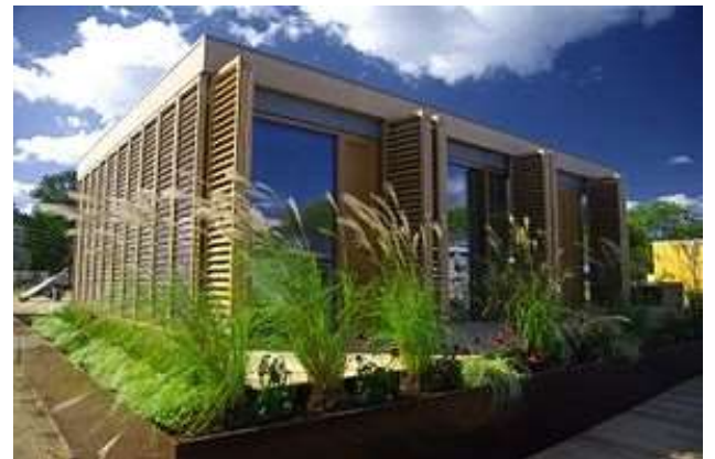
Fig(iii) Darmstadt University of Technology in Germany won the 2007 Solar Decathlon in Washington, D.C. with this passive house designed specifically for the humid and hot subtropical climate.

sustainability, energy conservation even of the order of 15% is considered substantial.