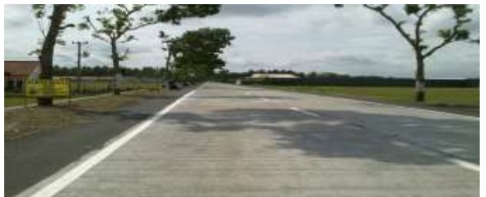
Fig.1: rigid pavement

It is the category of pavement which passes remarkable flexural strength or flexural rigidity. The material strength use in the construction of this type of pavement is portland cement concrete, either plain or reinforced. Therefore it is also called as 'CC' pavement. The cc pavement is expected to sustain up to 45 kg/cm2 of flexural stresses. The rigid pavement has a slab action and is capable of transmitting a wheel load through much wider area below the pavement slab. Flexural stresses are developed at different location in the cc pavement and critical combination of stresses is maximum in it. The stresses in the rigid pavement are analysed using elastic theory. Elastic theory state that, rigid pavement is an elastic plate resting over an elastic or viscous foundation the slab can serve as both wearing surface as well as effective base coarse