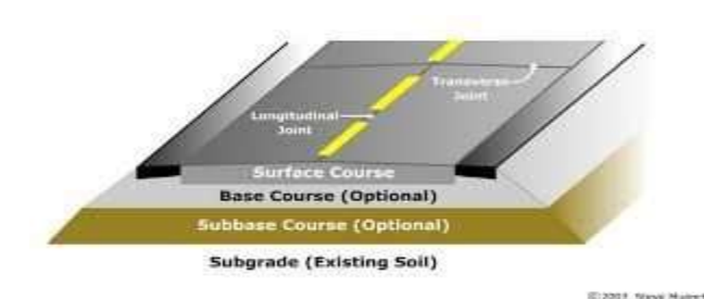
Fig.3: component of flexible pavement