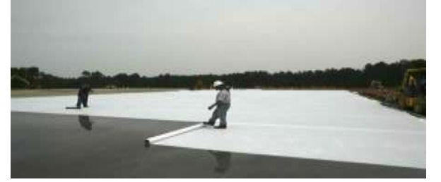
Fig-3: Curing by impervious paper 3. BEST AMONG ALL THE CURING DRIP CURING

Impervious paper for curing concrete consists of two sheets of kraft paper cemented together by a bituminous adhesive with fiber reinforcement. Such paper, conforming to, is an efficient means of curing horizontal surfaces and structural concrete of relatively simple shapes. An important advantage of this method is that periodic additions of water are not required. Curing with impervious paper enhances the hydration of cement by preventing loss of moisture from the concrete. As soon as the concrete has hardened sufficiently to prevent surface damage, it should be thoroughly wetted and the widest paper available applied. Edges of adjacent sheets should be overlapped about 150 mm (6 in.) and tightly sealed with sand, wood planks, pressure-sensitive tape, mastic, or glue. The sheets must be weighted to maintain close contact with the concrete surface during the entire curing period. Impervious paper can be reused if it effectively retains moisture. Tears and holes can easily be repaired with.