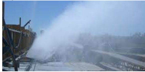
Fig-2: Curing by Fogging III. Using Impervious paper or plastic sheet

requires an ample water supply and careful supervision. If sprinkling is done at intervals, the concrete must be prevented from drying between applications of water by using burlap or similar materials; otherwise alternate cycles of wetting and drying can cause surface crazing or cracking.