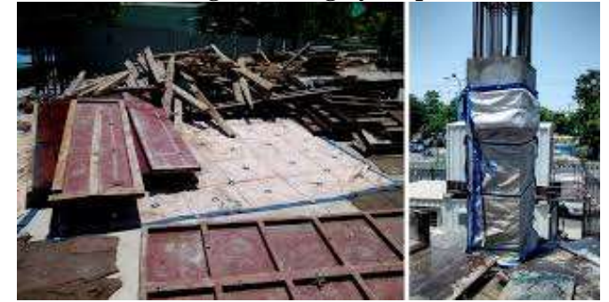
Fig-5: Curing by Drip