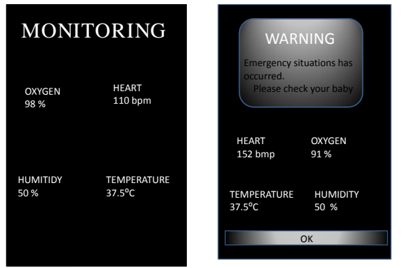
Fig 3. Baby-Care Application