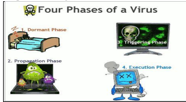
Fig-3: Four phases of an outbreak > Triggering part :

Triggering part are often caused by a spread of system events, together with a count of the amount of times that this copy of the virus has created copies of itself.