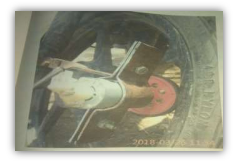
Fig 2. Dynamo fixed in Coupling.