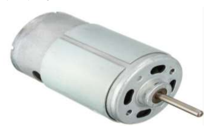
Fig.4. DC Dynamo

This fig shows the DC dynamo. By using the solid stand in place, there are more option for the motor setup in this system. In this system, it includes the DC motor as a generator alternator. The DC motor is to connect with the spinning back wheel directly to shaft of motor. The two options are to either have a direct coupled between the back wheel and motor shaft by using more grip between the wheel and shaft. The DC output of dynamo is given to battery.