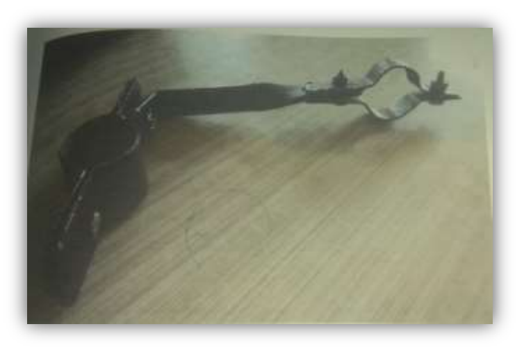
Fig 3. Mechanical Coupling.

The fig.2 shows the two iron sheet which is welded. Between two iron sheet dynamo is fixed and shaft of the dynamo is mechanically coupled with small wheel. This small wheel is rotated over a motor cycle which shows fig.3 The mechanical coupling is used in system. The too simple mechanical structure mounted on a front shock-up of the motor cycle. This coupling holds the dynamo which can rolls on the motor cycle wheel. As the wheel rotates with the speed then the dynamo connected to wheel also rotates with the speed of motor cycle and then this