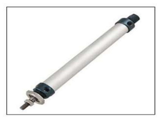
Fig. 1. Pneumatic Cylinder