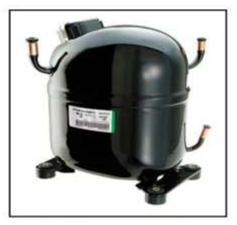
Fig 7. Air Compressor

This is use for measuring the outlet pressure of the air from compressor ,the guage is use is Bourdon type pressure guage the maximum capacity of guage is 10*10^5 to 12*10^5 N/m<sup>2</sup>