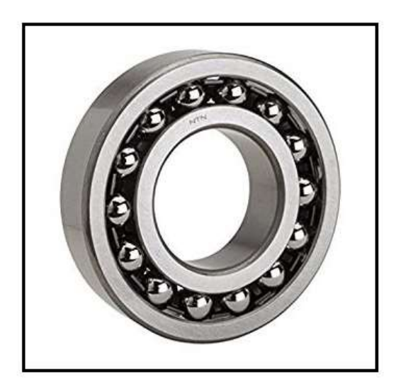
Fig 5. Ball Bearing