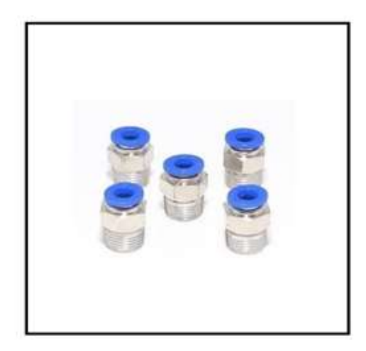
Fig. 3. Connectors

Maximum working pressure =10*10<sup>5</sup>N/m<sup>2</sup> Temperature=0-100c Fluid media=air Material=brass