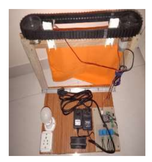
Fig: 4 (A) Experimental Setup

The following figure 4 (A) is the experimental setup of project. Our project is look like That in future when we build model of our project.