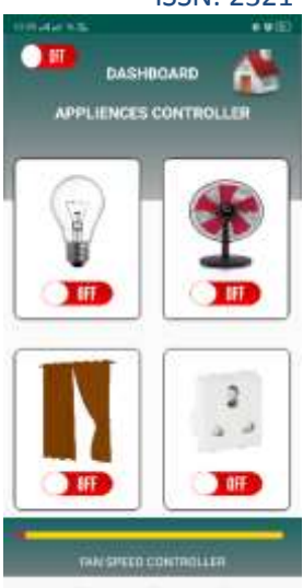
Fig:4(B) Application Dashboard