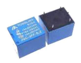
Fig: 3.4 Relay Driver Device

Relays are nothing but the switches that open and close circuits electromechanically or electronically. Relay is connected to the ESP32 and its output is connected to the home appliances in a sequence as (i) light (ii) fan (iii) curtains. Relay takes low current and voltage and triggers the switch which is connected to a high voltage. 4 input pins of relay are connected to ESP32 which takes 5V supply from it and can trigger up to 10A, 250V supply.