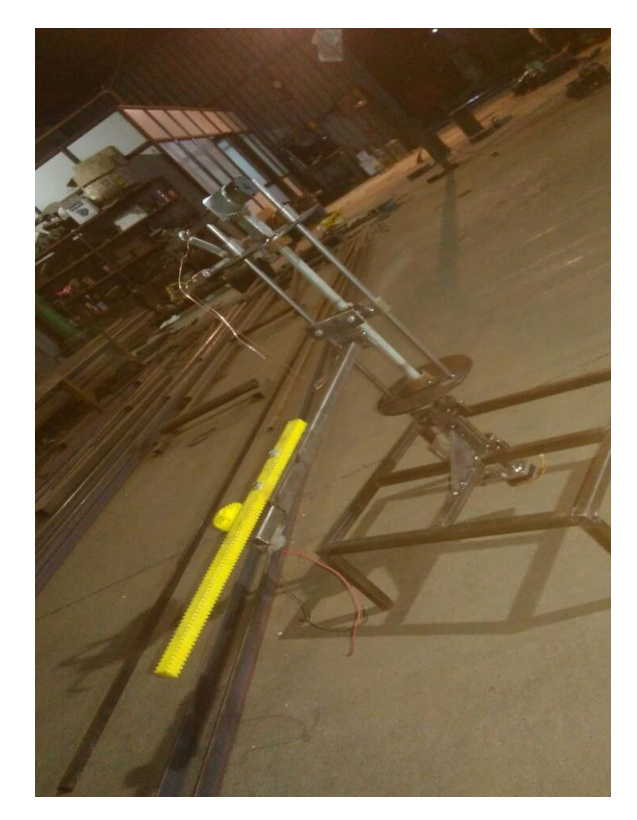
Fig.1 mechanical model

The mechanical model of the inclined drilling arm is shown in the figure as follows: